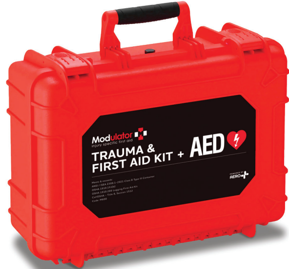
IP67 Waterproof Case for added protection